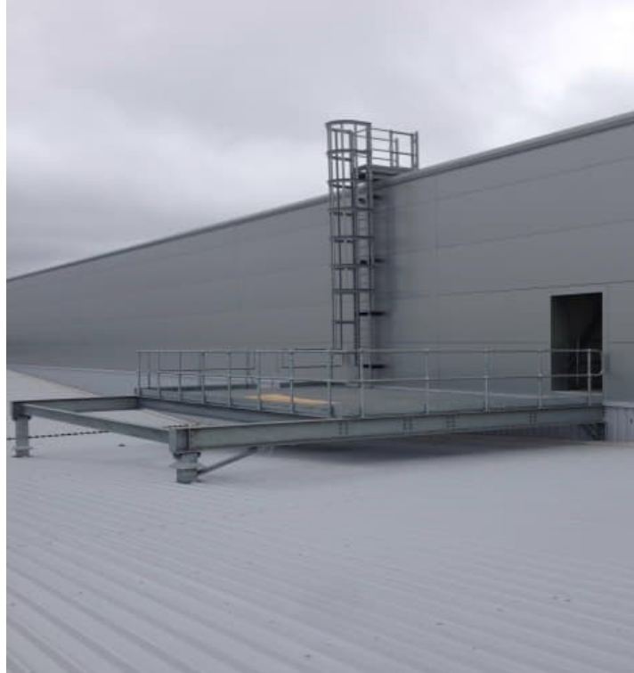
Blade Production Facility, Hull - Secondary Steelwork